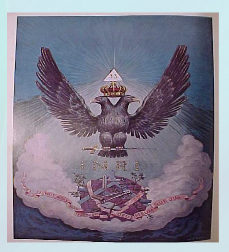
33° - Sovereign Grand Inspector General